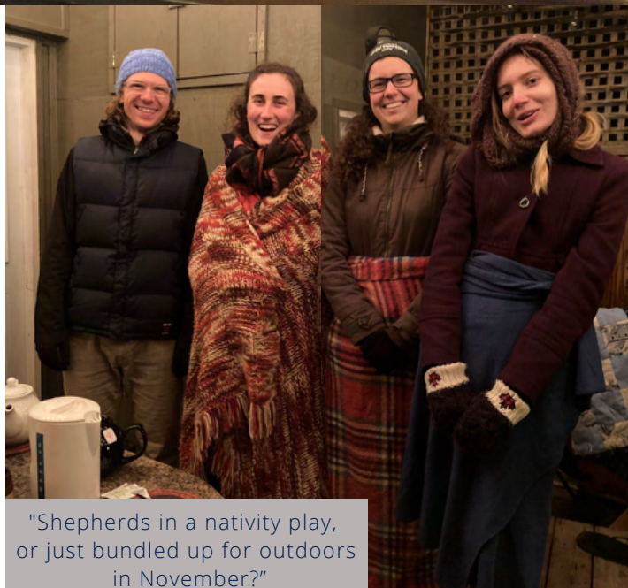
"Shepherds in a nativity play, or just bundled up for outdoors in November?"

If you're ever in downtown Toronto on Tuesday morning, we'd love to have you join us - just contact Brenda for details.