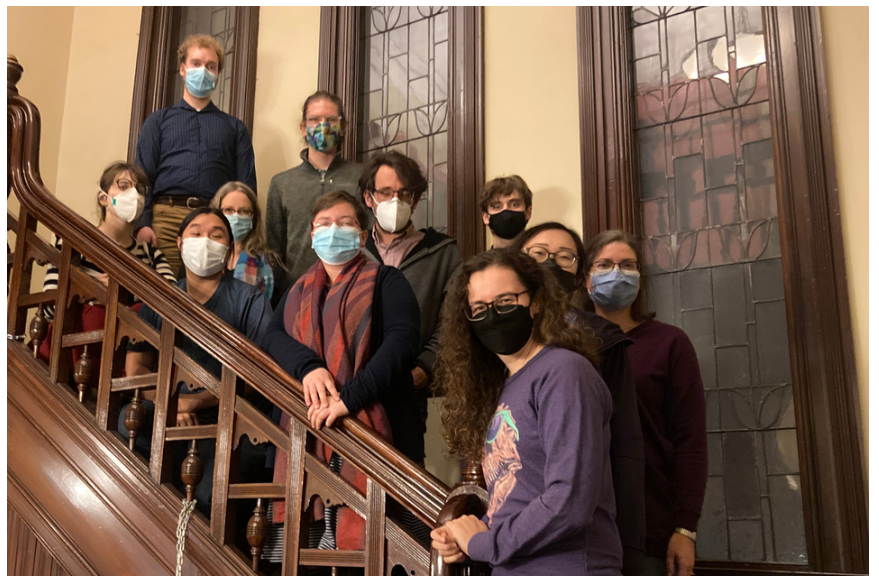
Members of GCF at the Toronto School of Theology building

As part of our desire to find concrete ways to learn from Indigenous people here in Canada, we hosted a Kairos Blanket Exercise at the end of September. We were invited into the story of Indigenous people in Canada through the use of physical blankets to represent the land and being assigned to represent different people (groups) throughout history. It was a moving experience for many, as we learned more of the history of our land and lamented how much harm many Indigenous people experienced, which continues to affect our society today.